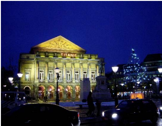
Royal theatre – Near centre

Sites to visit – For parents who would like to do some sight seeing whilst students are training please see sites of interest.